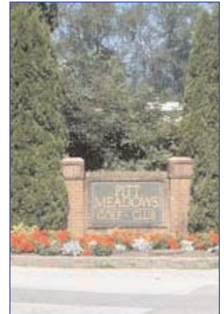
10th Annual Golf Fundraiser June 17th, 2004

Registration, sponsorship and other support have become easier than ever before with the Internet. This year, complete tournament information as well as registration & sponsorship information is located on the InnerVisions website at www.innervisionsrecovery.com . The form can be filled out online and submitted directly by email or printed out and faxed in. For more information, email to ivgolftourney@telus.net or contact 604-466-4215.