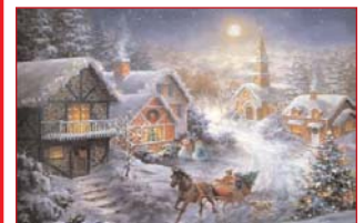
"Our day was filled with the true meaning of Christmas."

Thank you to all who care and have faith, our appreciation is immense. Through the grace of a power greater than our selves, this was Christmas at Hannah House.