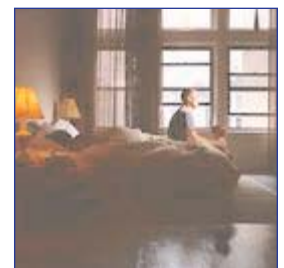
The InnerVisions Family Program strives to rebuild relationships

InnerVisions Recovery Society provides guidance, support and care for people affected by addiction with recovery programs based on an intensive integrated holistic approach which is contingent on their ability to participate.